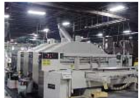
ICL's new Hycorr Rotary Die-Cutter