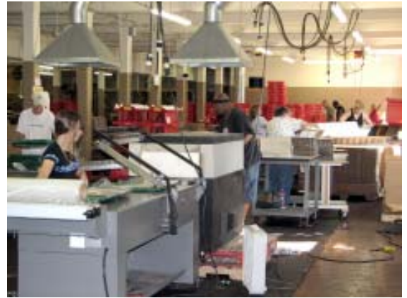
Fitchburg is a hive of activity - this is the busiest time of the year for the plant.